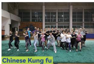
Chinese Kung fu