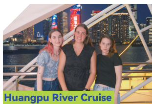
Huangpu River Cruise

Experiencing something and hearing about something are totally different! Abundant cultural activities enable students to experience the Chinese culture and traditions, to achieve multicultural understanding and establish a global vision.